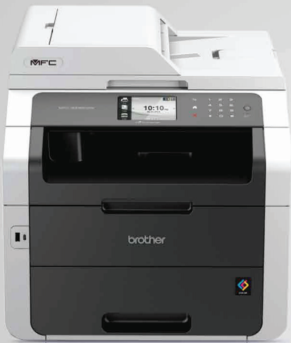
Colour LED Multi-Function Centre with Networking Capability (Print / Scan / Copy / Fax)